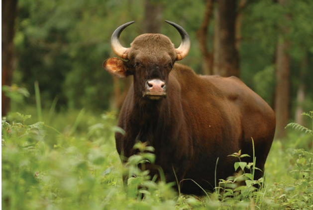
Fig. 2. —Adult female Bos gaurus with typical brown pelage and smooth, spiral-shaped horns from BR Hills, southern India.