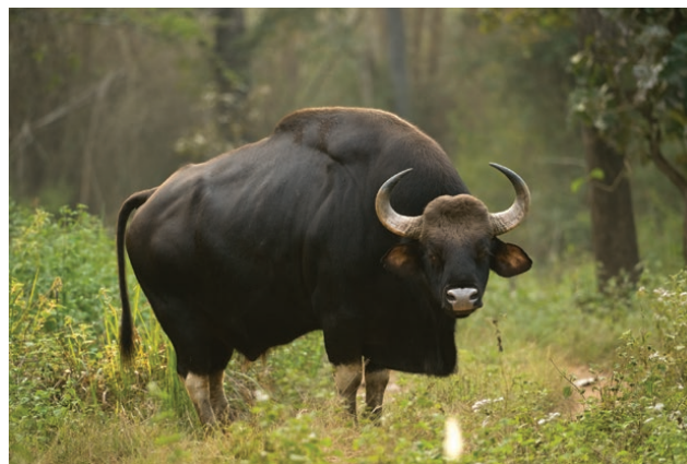
Fig. 1. —Adult male Bos gaurus with conspicuous dorsal ridge and dewlaps from Nagarhole Tiger Reserve, southern India.

Bison sylhetanus : Jardine, 1836b:257. Name combination.