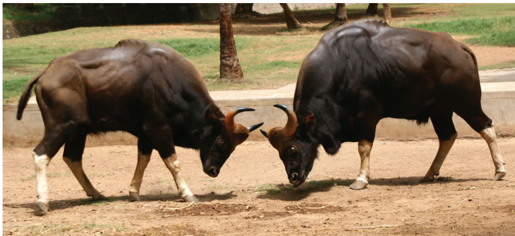
Fig. 8.—Two (3- and 6-year-old) captive male Bos gaurus sparring in Mysore Zoo, southern India.

Reproductive behavior. —Adult males and females have been observed licking each other, and it is assumed such