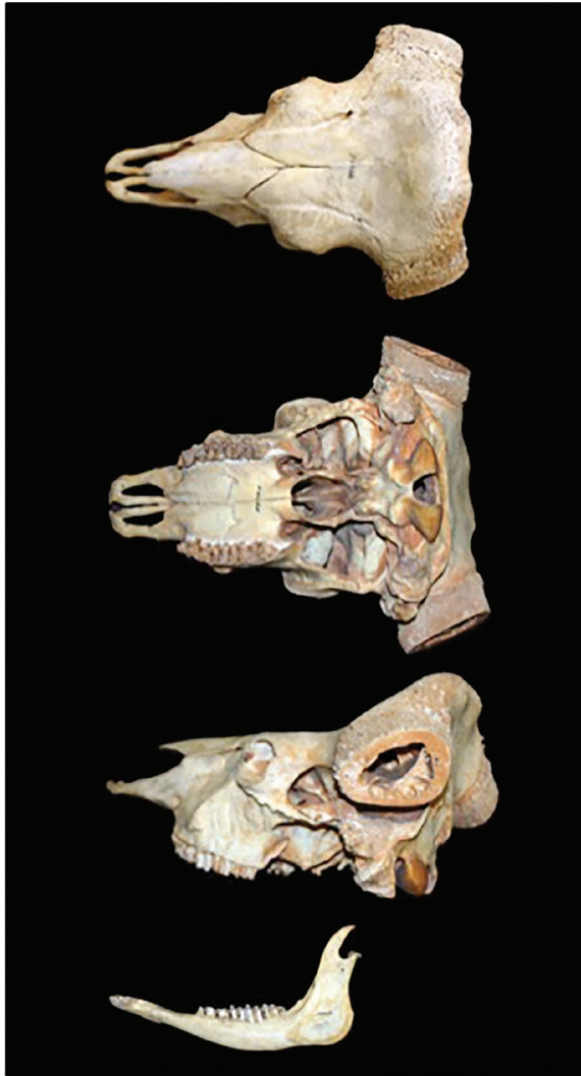
Fig. 5. —Dorsal, ventral, and lateral views of skull and lateral view of mandible of adult male Bos gaurus (American Museum of Natural History, New York, [AMNH] specimen 54468). Greatest length of skull is 683 mm.

season. However, it is unclear if this behavior is driven by some ecological need or if it is a function of the fact that the majority of all remaining habitat available to B. gaurus is hilly terrain as nearly all suitable habitat in the plains have been lost to agriculture (Schaller 1967).