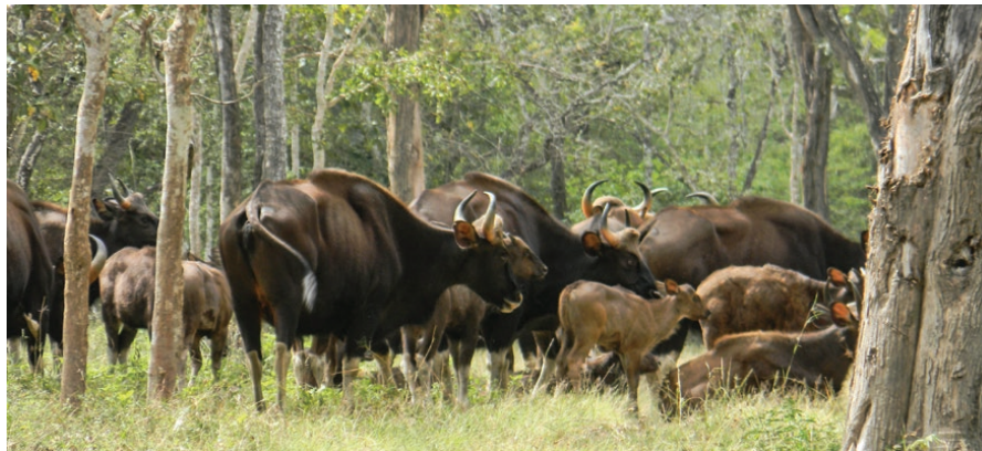
Fig. 7. — Bos gaurus herd with adult females and calves from Bandipur Tiger Reserve, southern India.