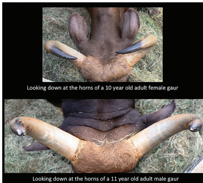
Fig. 3.—Differences in thickness, shape, and curvature of horns, and thickness of neck between female and male Bos gaurus from Mysore Zoo, southern India.

Bos gaurus is a sexually dimorphic species (Figs. 1 and 2), and differences between the sexes begin to be noticeable after the age